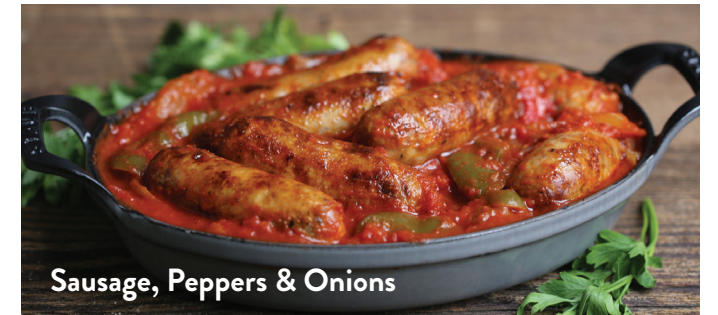
Sausage, Peppers & Onions