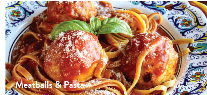
Meatballs & Pasta