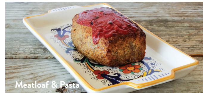
Meatloaf & Pasta